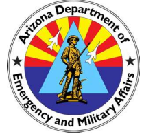
Major General Kerry L. Muehlenbeck THE ADJUTANT GENERAL

5636 East McDowell Road Phoenix, Arizona 85008-3495 (602) 267-2700 DSN: 853-2700