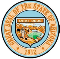
Katie Hobbs GOVERNOR