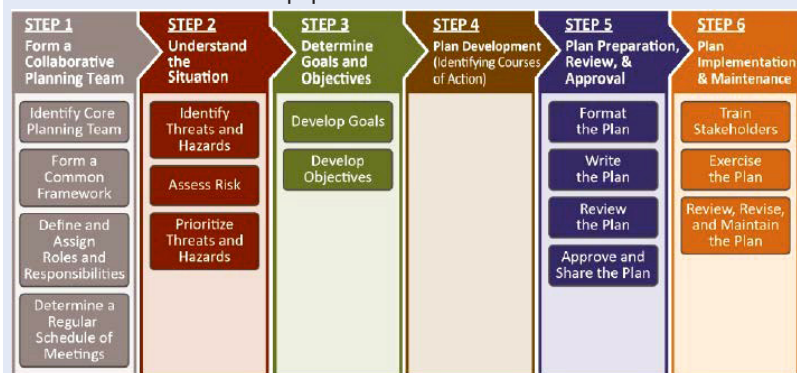
Figure 1: Steps in the Planning Process

Arizona Department of Education April 2019