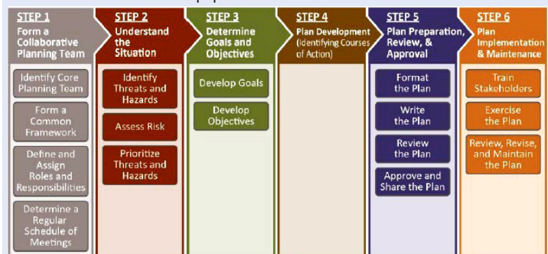
Figure 1: Steps in the Planning Process

Figure 1 depicts the six steps in the planning process. Each step in the planning process, Schools should consider the impact of their decisions on ongoing activities such as training and exercises, as well as on equipment and resources.