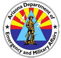
Major General Kerry L. Muehlenbeck THE ADJUTANT GENERAL

5636 East McDowell Road Phoenix, Arizona 85008-3495 (602) 267-2700 DSN: 853-2700