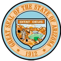
Katie Hobbs GOVERNOR

5636 East McDowell Road Phoenix, Arizona 85008-3495 (602) 267-2700 DSN: 853-2700