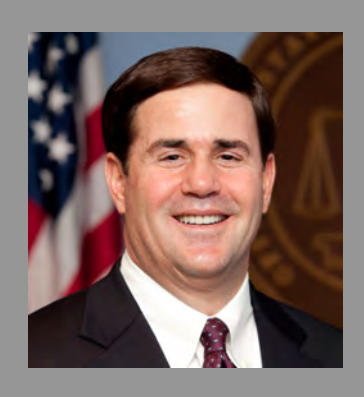
HON. DOUG DUCEY TREASURER