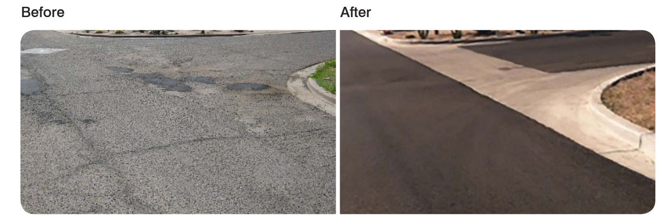
Photo 1: Superstition Villa subdivision before and after improvement