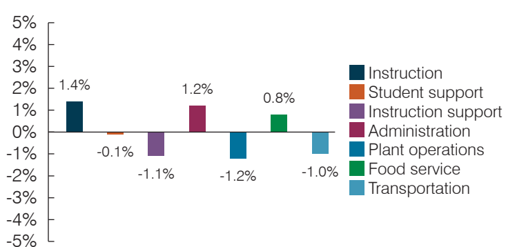
Percentage point change in spending by operational area (fiscal year 2014 versus 2019)