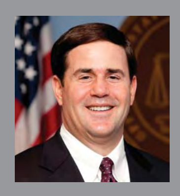
HON. DOUG DUCEY TREASURER