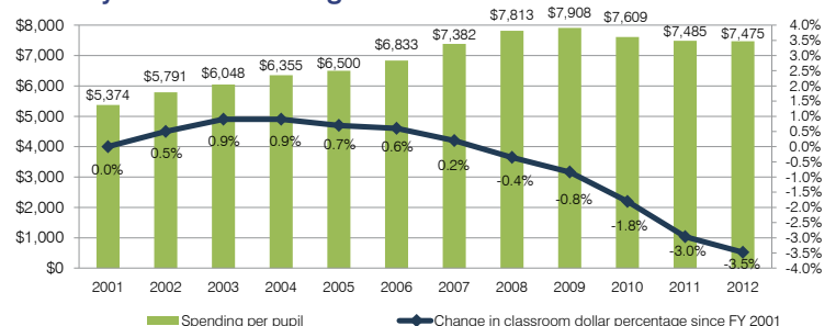
Arizona's operational spending per pupil and change in classroom dollar percentage since fiscal year 2001 Fiscal years 2001 through 2012

In fiscal year 2012, Arizona districts spent 54.2 percent of their available operating dollars on instruction—the lowest percentage in the 12 years auditors have been monitoring district spending. In fiscal year 2001, Arizona districts spent 57.7 percent of available operating dollars on instruction. Then, in fiscal year 2002, districts began receiving Classroom Site Fund (CSF) monies intended to increase classroom spending. Soon after, in fiscal years 2003 and 2004, the State's classroom dollar