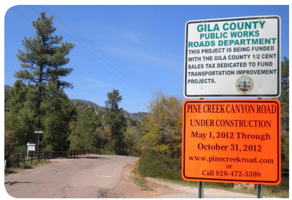
Photo 1: Pine Creek Canyon Road—before and after road improvements

• Pine Creek Canyon Road—This approximately 1-mile project, completed in December 2012, included road reconstruction to allow for improved emergency vehicle access to homes, safer driving conditions for residents, and replacing the aging drainage system to prevent flooding (see Photo 1 for before and after photos). This project cost approximately $1.6 million, of which the County contributed $1.3 million in excise tax monies. In addition, the Pine-Strawberry Water Improvement District contributed an additional $260,000 for the project.