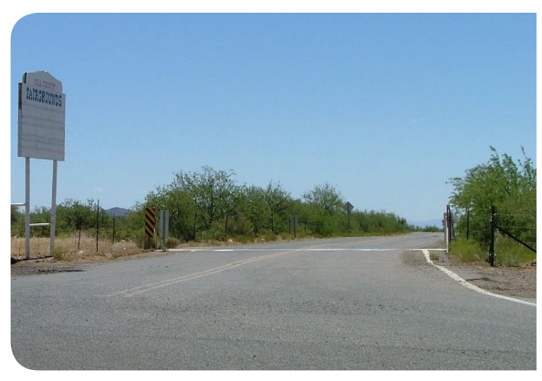
Photo 2: Fairground's road entrance—before and after road improvements

• Fairground's road entrance—The fairground's road entrance project was divided into two phases. Phase I was completed in October 2008, and Phase II was completed in February 2012. Phase I included engineering and reconstructing the pavement. During Phase II, the County resurfaced approximately 1.3 miles with chip seal to protect the pavement and extend the life of the road. The fairground's road entrance is on a state highway that the County's residents use extensively. The improved road entrance makes it safer to access the fairgrounds and reduces traffic congestion along the highway (see Photo 2 for before and after photos). This project cost approximately $344,000 and was paid for with excise tax monies.