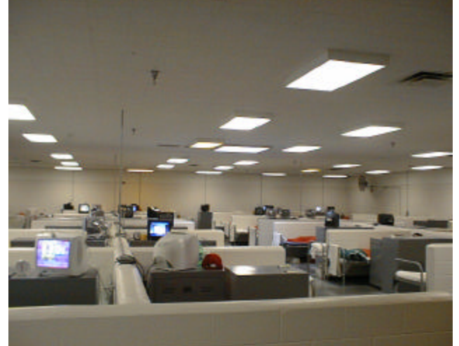
Dormitory-style housing at a private prison specifically designed for substance abuse treatment.